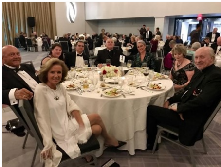
Head Table at the Saturday evening dinner .