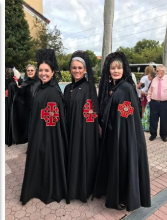
Dames of the Holy Sepulchre .